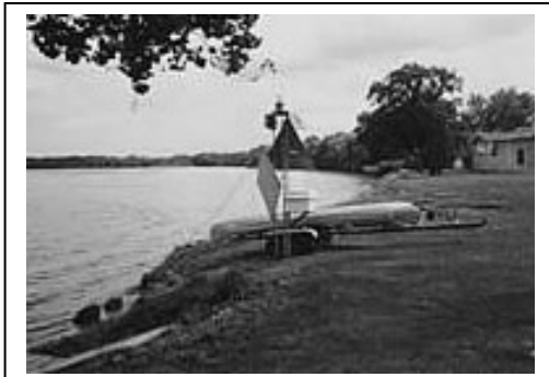
Bonnell Light and Day Mark

listed on the river navigation charts as "Bonnell Light and Day Mark #274.0." The rehabilitated stone house is still