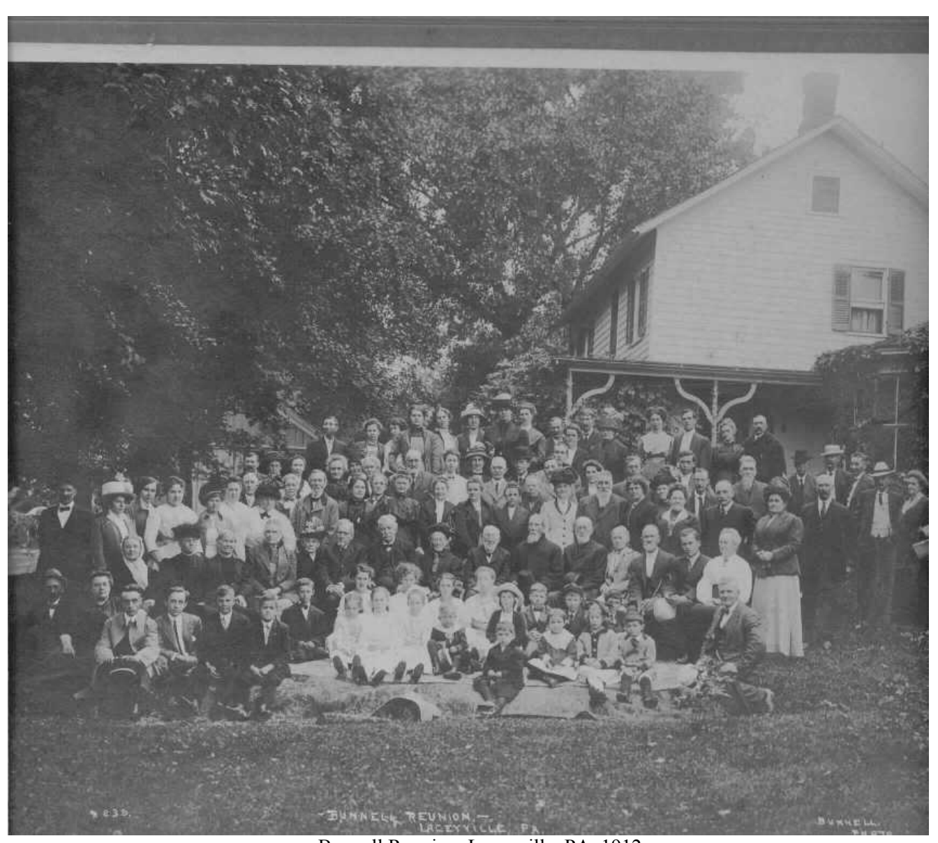
Bunnell Reunion, Laceyville, PA, 1912

Unfortunately, there are no names available. If anyone wants an electronic version of it, I can e-mail it at no cost.